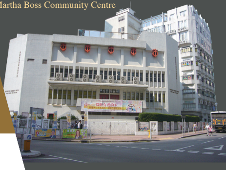
Martha Boss Community Centre

In 1986, the Martha Boss Community Centre was completed. The centre, which is the HKLSS headquarters, serves more than 100,000 residents of the Kowloon City District, including 25,000 students and over 38,000 elderly, blind, deaf and other disabled people. With God's provision and blessing, new projects are constantly emerging so that people from all walks of life can be served.