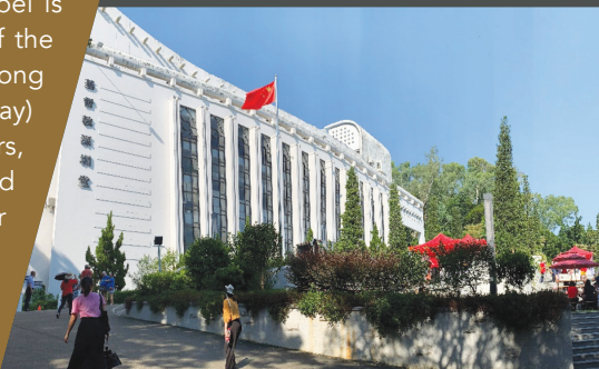
Christian (Protestant) Church in Shenzhen