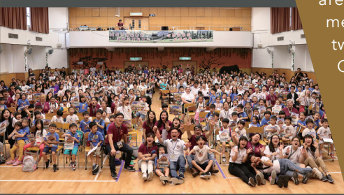
2019 VBS Graduation in One of Our Schools

As far as local schools are concerned, the LCHKS operates 6 primary schools, 6 secondary schools and 2 special schools (one for the deaf, the other for students with special needs) which are aided by the Hong Kong government. All these schools along with 22 kindergartens and nurseries are endorsed by the Hong Kong Education Bureau. Besides, our Synod runs 6 evening secondary schools and 6 other educational centres. More than 18,000 students are served by more than 1,000 teachers and staff members in our educational system. There are also two international schools with American curriculum, Concordia International School in Hong Kong (since 1990) and Buena Vista Concordia International School in Shenzhen (since 2011). Moreover, the LCHKS and its schools, both local and international, welcome Lutheran volunteers from the US who come on a continuing basis as short-term mission teams, who serve as long-term missionaries and who help every year to launch Vacation Bible Schools (VBS). Indeed, all the time, there are plenty of mission opportunities to serve with the LCHKS in Greater China.