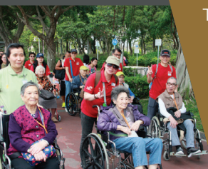
Commitment, Compassion and Community

The LCHKS practises the Lord's command to "love your neighbour as yourself" by catering for the needs of the community, particularly by caring for the disadvantaged members thereof. Hong Kong Lutheran Social Service (HKLSS) is one of the non-governmental charitable organisations in Hong Kong. At the present moment, HKLSS has a team of over 1,000 professional and quality staff members and supervises over 50 service units and is providing different kinds of services such as caring for children, youth, the elderly, families and rehabilitation and community development services. These services are provided all over Hong Kong and Macau.