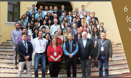
Educators from the Concordia International Schools

As far as local schools are concerned, the LCHKS operates 6 primary schools, 6 secondary schools and 2 special schools (one for the deaf, the other for students with special needs) which are aided by the Hong Kong government. All these schools along with 22 kindergartens and nurseries are endorsed by the Hong Kong Education Bureau. Besides, our Synod runs 6 evening secondary schools and 6 other educational centres. More than 18,000 students are served by more than 1,000 teachers and staff members in our educational system. There are also two international schools with American curriculum, Concordia International School in Hong Kong (since 1990) and Buena Vista Concordia International School in Shenzhen (since 2011). Moreover, the LCHKS and its schools, both local and international, welcome Lutheran volunteers from the US who come on a continuing basis as short-term mission teams, who serve as long-term missionaries and who help every year to launch Vacation Bible Schools (VBS). Indeed, all the time, there are plenty of mission opportunities to serve with the LCHKS in Greater China.